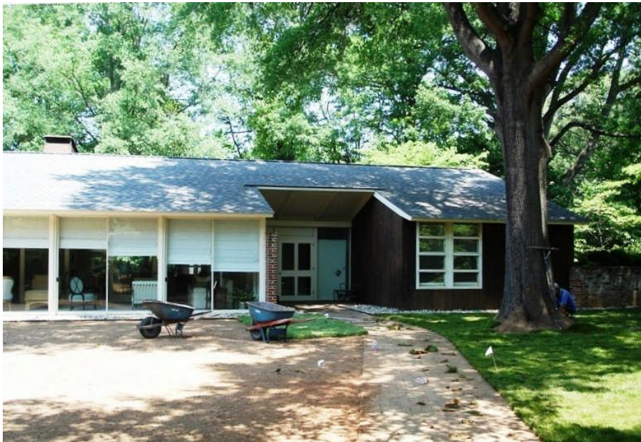
Façade view, front entrance

Greensboro, Guilford County, GF4960, Listed 8/13/2008 Nomination by Cynthia de Miranda Photographs by Cynthia de Miranda, May 2007