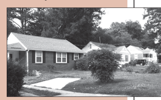
Capitol Heights houses feature Neoclassical details.

MADONNA ACRES: Just east of St. Augustine's College, this neighborhood comprises one long street with four small cul-de-sacs. It was begun in 1960, and features a number of well-preserved ranches and split-level houses with Modernist features. Many of the original residents were associated with the college.