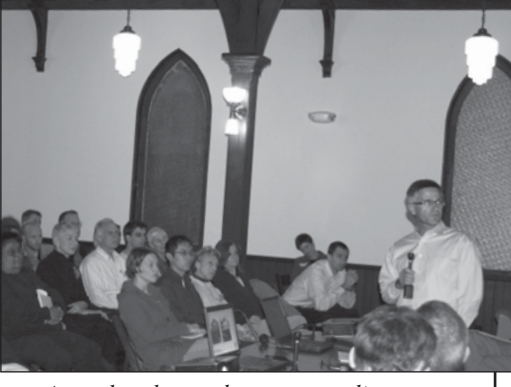
Attendees learn about tax credits at a January Conversation.

During the past year RHDC's Community Awareness Committee has hosted several Community Conversations, events intended to spark dialogue about local historic preservation issues. The Raleigh community has turned out for multiple programs that addressed the topics of historic preservation and sustainable development, design tools for neighborhoods, the economic benefits of historic preservation, and the federal and state historic preservation tax credit pro-To view grams. Speakers have conversations, visit included nationallyknown preservationists, www.rhdc.org