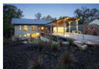
PHOTO GALLERY August Home of the Month 08.27.10 (18 images) Bridge (House) over troubled waters