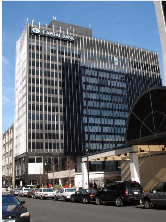
333 Fayetteville Street