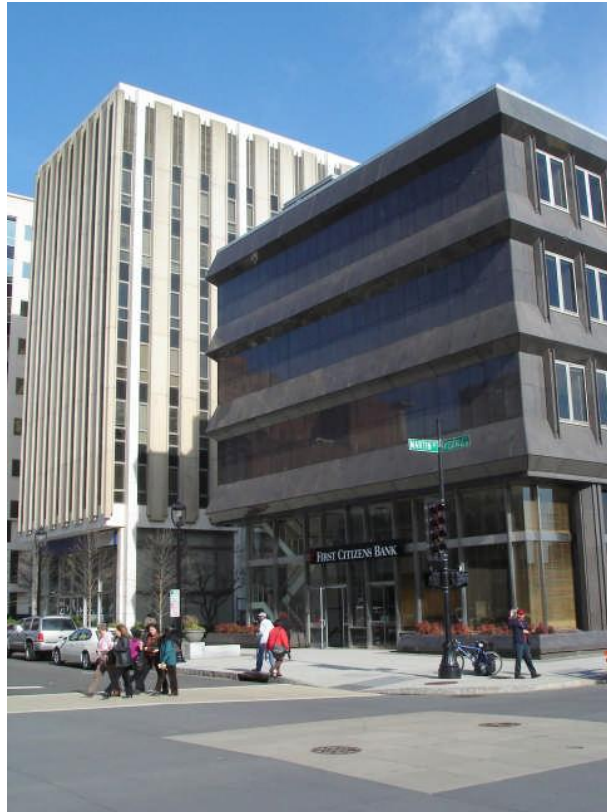
227 and 239 Fayetteville Street

Photographs by Cynthia de Miranda, January 2007