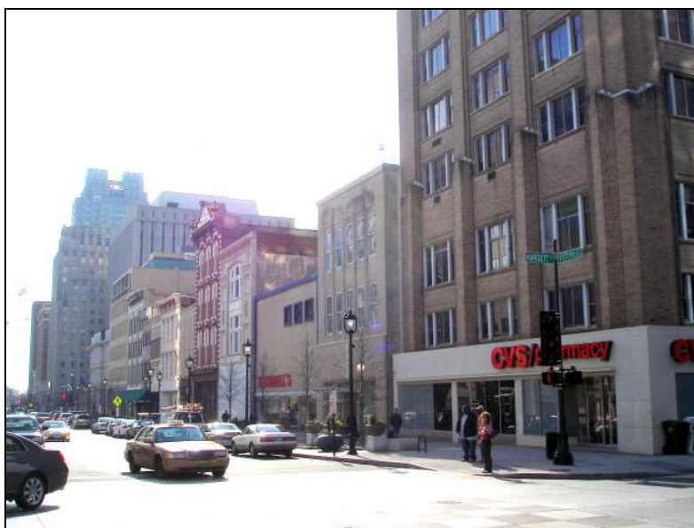
200 block of the west side of Fayetteville Street